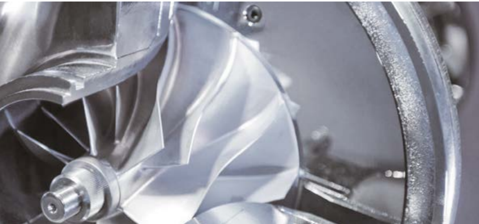
The AERZEN turbo impeller. Individually designed for every performance class – peerless efficiency.

AERZEN turbo blowers. Over the years we have perfected the technical excellence of our assemblies, acquiring an expertise that has set the global standard in the process. This is reflected in improved energy efficiency, low life cycle costs and specially developed core components. It is an expertise present in every detail of AERZEN's continuous flow machines.